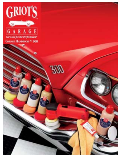
LeMay 1959 Chrysler 300