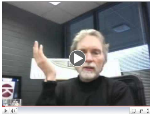
Whatever You Do, Don't Say "Museum!" - Autoline After Hours 93

Click here to see the full show (episode #93) or view below: