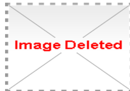
The '64 "Papal Continental" transports the Apollo 8 crew through the streets of Chicago.

Talk about a gift from the heavens: ACM announced the surprise arrival of a 1964 Lincoln Continental limousine custom-made to protect Pope Paul VI and later used to shuttle Apollo astronauts Neil Armstrong, Buzz Aldrin and Jim Lovell during ticker-tape parades in Chicago. The one-off limo is on loan to the museum from the Apex Foundation and is currently being displayed in the front lobby.